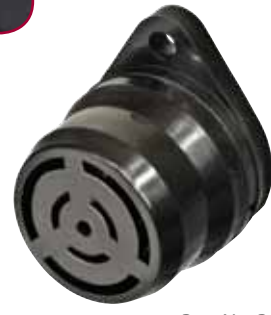
Part No. B12