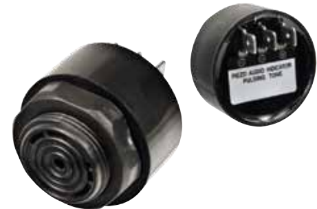
Part No. B657