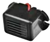
Part No. B122