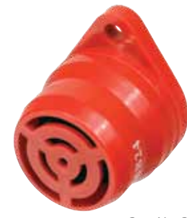
Part No. B24