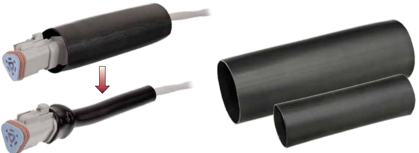
Heatshrink - Strain Relief Sleeves